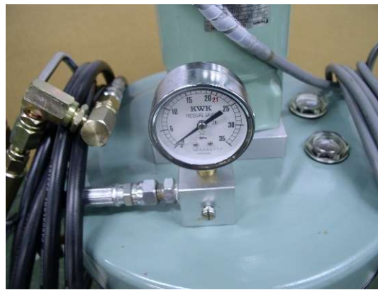
● Pressure Gauge *Option