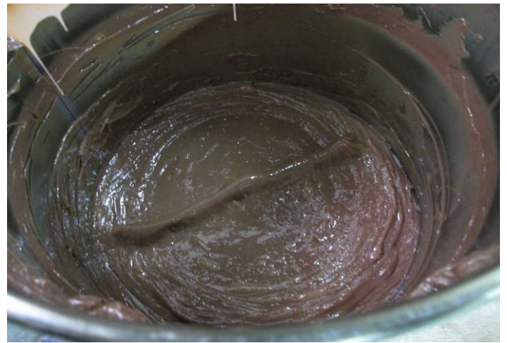
● You can use up the grease to the bottom.