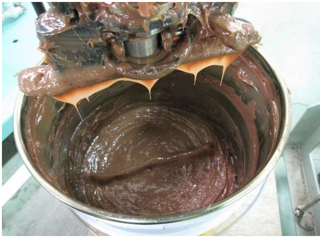
● Agitator blade levels the surface of grease.