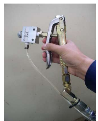
● Spray Nozzle *Option